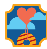
My Cookie Business Resume