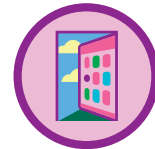
My Cookie Team