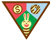
My Cookie Customers