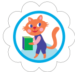
Cookie Goal Setter