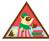
Cookie Decision Maker